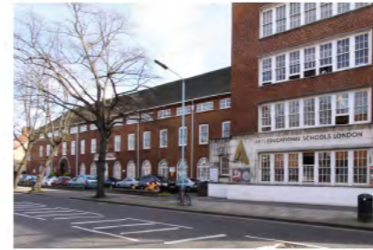
View of Arts Ed from outside

The redevelopment of Arts Educational School grew out of a close working relationship with the Department Heads to examine the condition, limitations and missed opportunities within the existing school buildings and site.