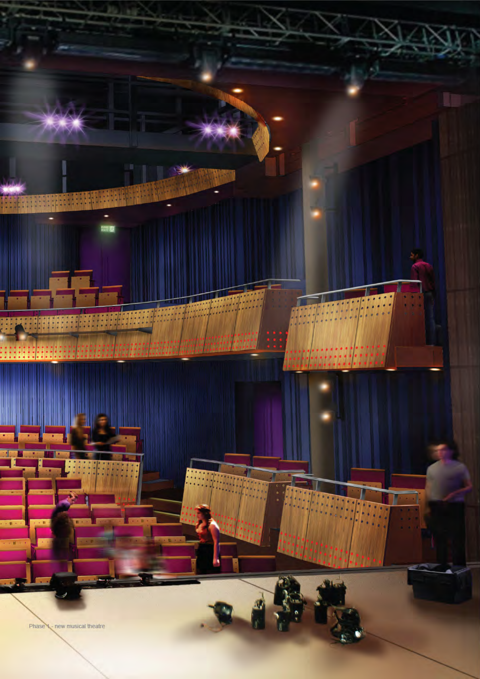
Phase 1 - new musical theatre