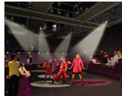
Proposals for the studio space

The projects were carefully packaged together to enable the building work to proceed whilst the school remained safe and operational. Summer holidays were targeted for major structural and disruptive works to minimise loss of space for paying pupils.