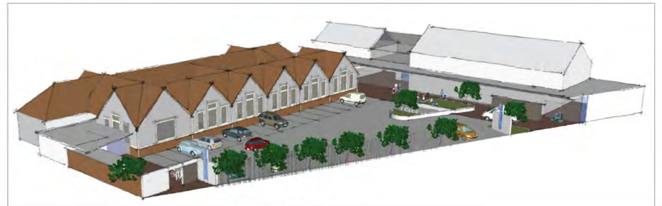
View of overall site layout

Currently QPAC is in the process of fundraising for these works.