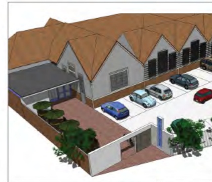
New entrance and cafe terrace

This small but vibrant community Arts Centre was in need of a mixture of refurbishment works, together with a rationalisation of their performing arts, crafts and ceramics studios in order that each space could be used independently. Piecemeal work over the years had led to a series of interlinked spaces which could not always be used concurrently. They were run down and often not fit for purpose in terms of lighting, acoustics and facilities.