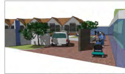
New entrance and studio theatre

Client: Queens Park Arts Centre (QPAC) Value: £1 - 5 million Design Study: 2012 Role: Architect / lead designer