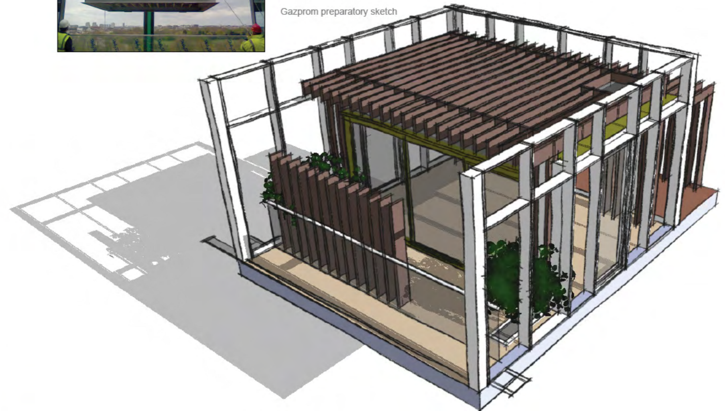
Gazprom preparatory sketch

The installation was completed in May, on time and on budget.