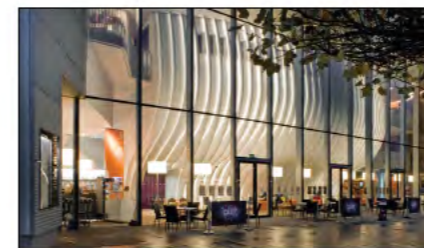
Exterior view from the new public square