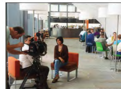
The new cultural living room